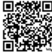
Scan the QR Code to get the online form

A Certificate of Completion will be emailed to you within two weeks of receiving your completed attendance form.